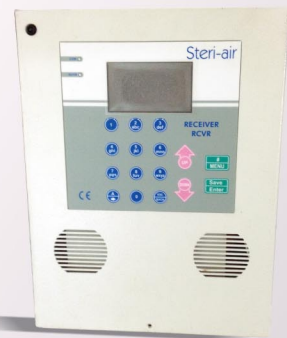
Decontamination Module Dimensions 22(w) x 29(d) x 29(h) cm