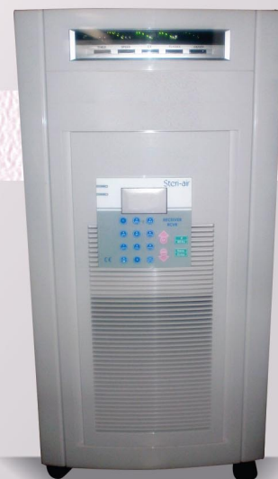
Filtration Module Dimensions 45(w) x 35(d) x 92(h) cm